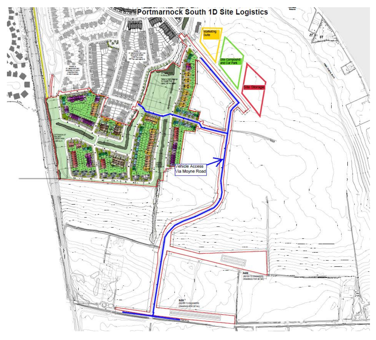
Figure 2.0: Site Logistics

Set out below are the general principles of the site logistics, these will be developed in greater detail as the site progresses.